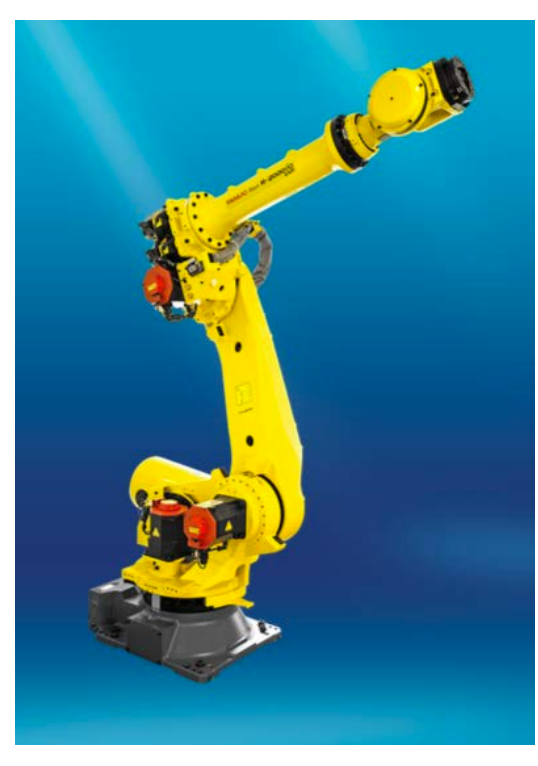
FANUC R-2000 series robot

Precision Automated Technology designed a solution that incorporated four Fanuc robots. Two Fanuc R-2000 series and two Fanuc M-700 series robots.